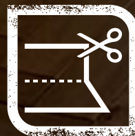
CUT & FOLD