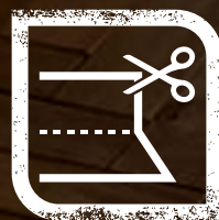
CUT & FOLD