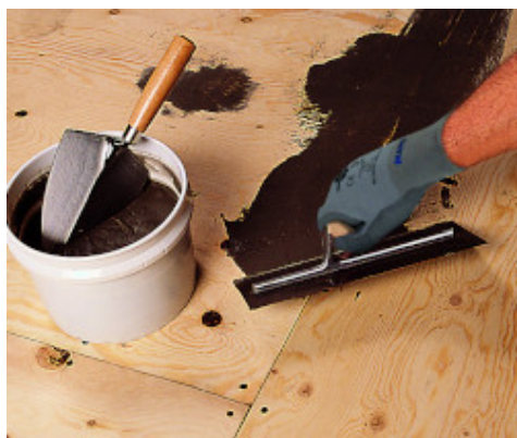
Grouting a plywood substrate with Nivorapid + Latex Plus