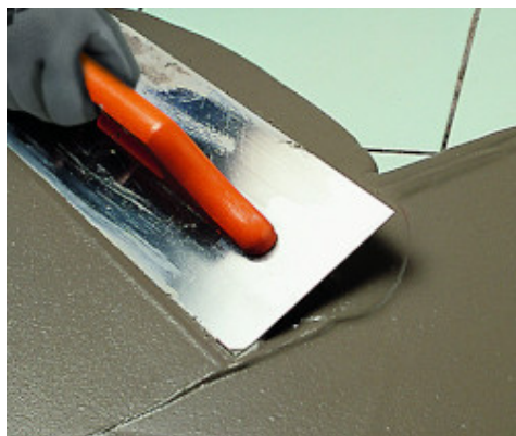
Levelling of existing floor with Nivorapid