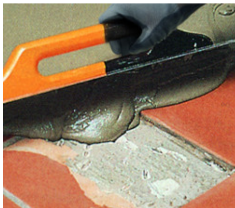
Filling holes with Nivorapid