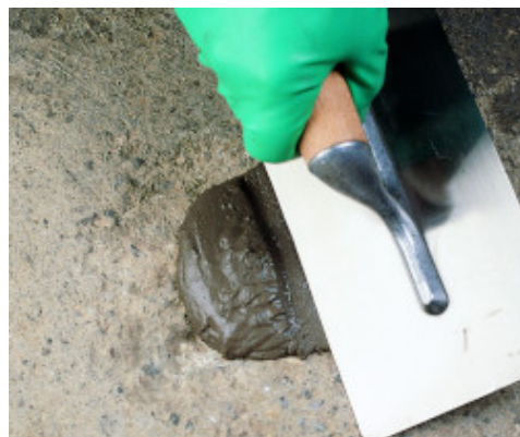
Repairing horizontal arrises with Nivorapid