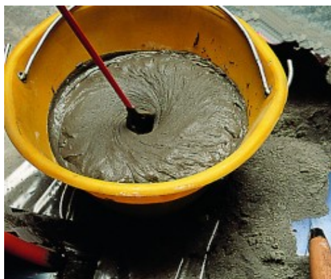
Nivorapid mixed with mechanical mixer