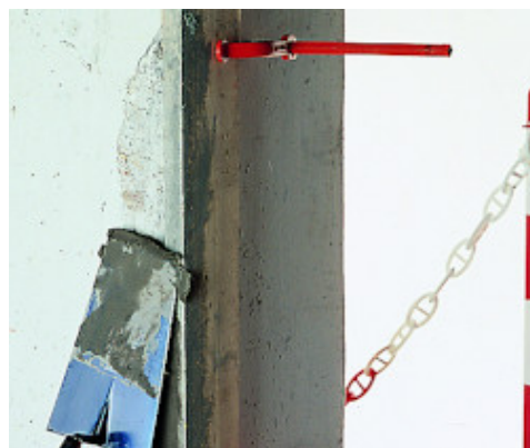
Repairing vertical surface with Nivorapid