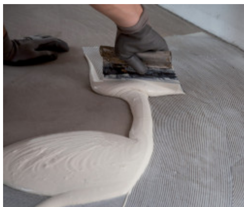
Application of Ultrabond Eco V4 SP Fiber on a substrate

Note: waiting and open time may vary depending on temperature, relative humidity and absorbency of the substrate. They will be shorter at higher temperatures and lower humidity, but longer at lower temperatures, higher humidity and with low-absorbent substrates.