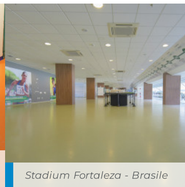
Stadium Fortaleza - Brasile