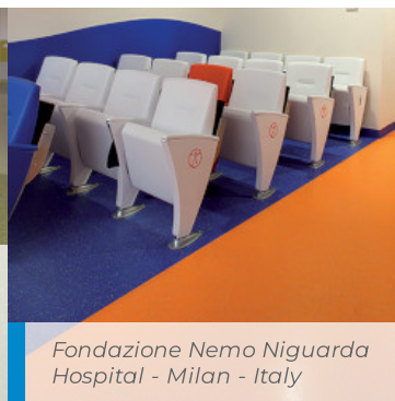
Fondazione Nemo Niguarda Hospital - Milan - Italy