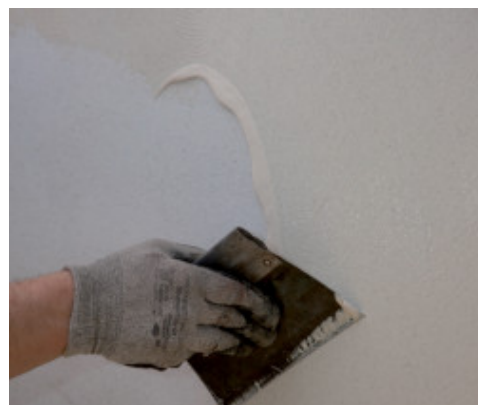
Application of Ultrabond Eco V4 SP Fiber on a wall