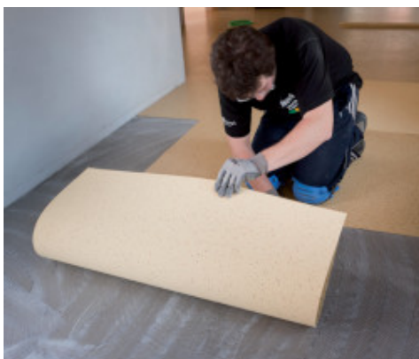
Installation of rubber tiles