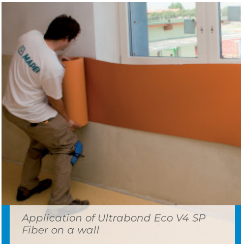
Application of Ultrabond Eco V4 SP Fiber on a wall