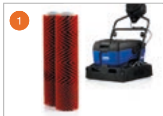
Ensure suitable brushes are used