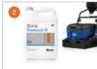
Mix Bona Remove R according to instructions