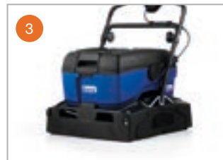
Clean the floor by covering the area in linear order